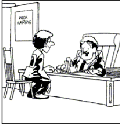
Always Meet With Your Advisor!

HY 465/565 – Islamic Civilization: The Crusades from the Other Side (Williams)