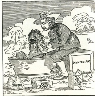
“If General Wood Is Unpopular with Cuba, We Can Guess the Reason.” From Minneapolis Tribune (1901), reprinted in Literary Digest 22 (March 30, 1901).

decades-long struggle between Cuban independence insurgents and their Spanish colonial masters, a particularly egregious move since the insurgents were on the brink of victory. From 1898–1902, the U.S. excluded Cuban rebels from key battles and negotiations, deradicalized the aims of the movement, militarily occupied